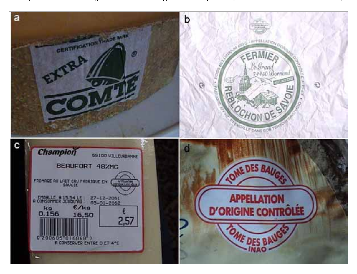
Figure 3. Labeling in AOC cow milk cheeses from Eastern France. a. The Comté Bell logo registered as certification trademark in USA in addition to AOC protection in France. b. Individual wrapping for Reblochon de Savoie , green indicates it is a farmer cheese. c. Supermarket label for slices of Beaufort cheese: note the AOC logo guaranteeing integrity of the product. d. The obligatory INAO logo in a Tomme des Bauges presentation for supermarkets.

Farmers from mountain areas in developed countries face further trade liberalization, technological advances and changes in consumer behavior. However, they are confident in consumer willingness to pay a price differential for quality products and consider it indispensable to keep rigorously to regulations. The development of quality labels related to tradition, origin and the environment is a regional process in which many AOCs are experiencing growth: Beaufort and Reblochon doubled production between 1985 and 2000, and Abondance grew 5 times during the same period (Chatellier and Delattre 2003).