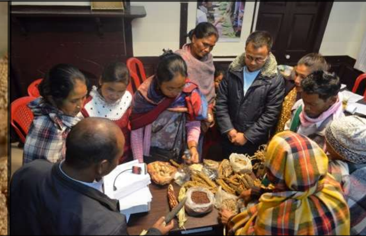
Millet Network Growth by Village