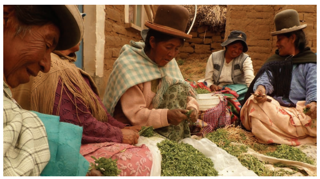
Women work together while chopping alfa alfa (H. Gruberg 2012)

Following from these insights, it will be important to consider the nature of each community of intervention so as to determine whether to work in promoting collective action rather than or in addition to working with individual farmers. The involvement of the rest of the community in Cachilaya is clearly required, otherwise the work of the custodians of agricultural biodiversity is limited in the sense that people may no longer want to share seeds or planting material with them, creating barriers in the seed flows. In this respect, community seed banks, which are more advanced in South Asia (e.g. Shrestha, Vernooy et al. 2013), are seen as a highly complementary strategy to supporting custodian farmers in on-farm conservation. Further investigation is needed to fill gaps in knowledge on how to complement the roles played by individuals (custodian farmers) with those of collective efforts (such as community seed banks) with regards to the maintenance, valorisation, and sharing of both genetic diversity and traditional knowledge.