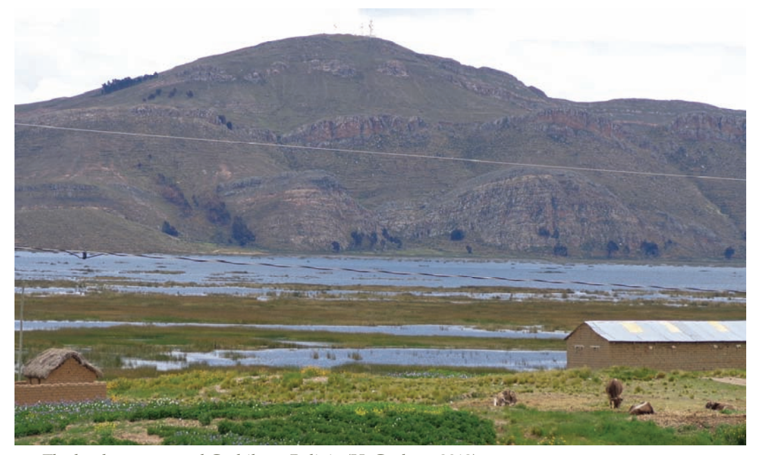
The landscape around Cachilaya, Bolivia.

study, numerous quinoa plots were flooded leaving many families without seeds for the subsequent agricultural season. The fish of Lake Titicaca, which used to be an important part of their basic diet, have also virtually disappeared. It is in this setting of lush Andean beauty and difficulties where the stories of Cachilaya's outstanding custodian farmers occur.