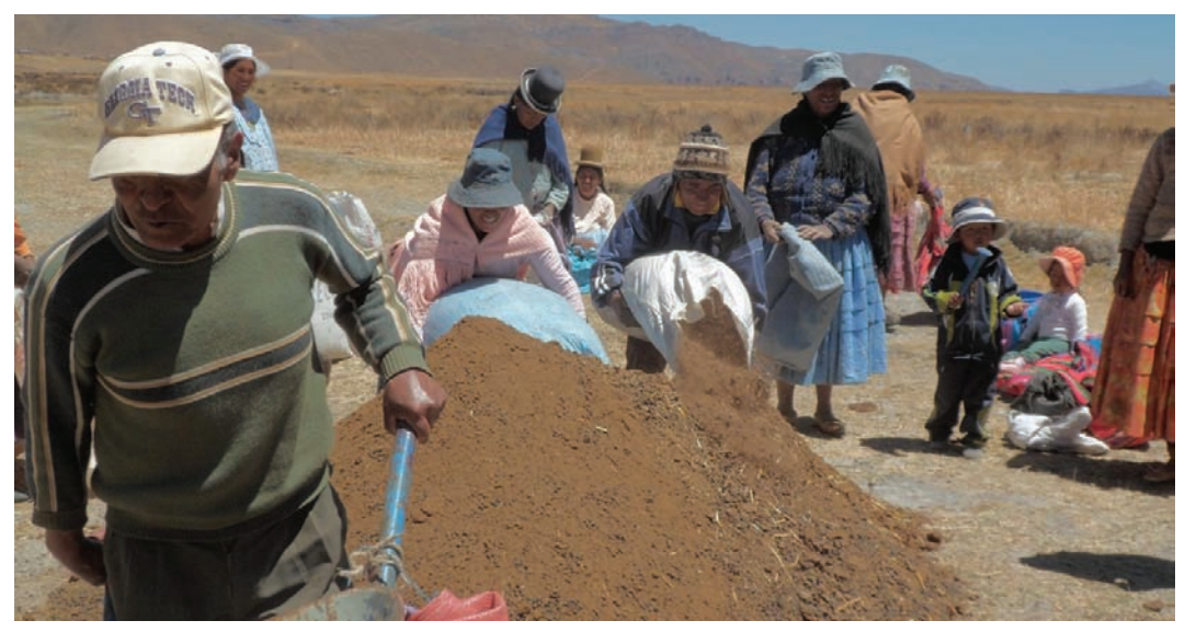
Farmers prepare manure compost to enhance soil fertility.