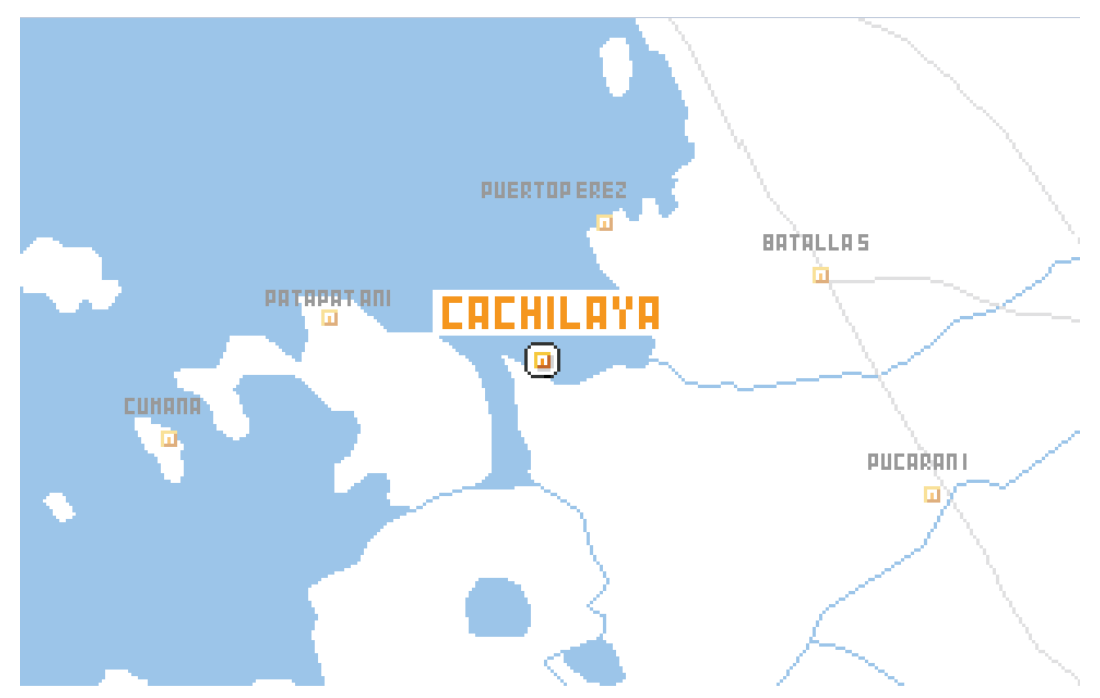
The location of Cachilaya on the southern shores of Lake Titicaca (map from nona.net).

Cachilaya maintains traditional territorial organization customs wherein the territory is divided in three production systems: aynoqas, kjochi iranas and sayañas. The aynoqas are managed as a commons with a rotational system in time and space, such that crops are interspersed with fallow periods to permit soil recovery. Each year the community members decide which crops will be cultivated where, defining the quantity and characteristics of local crop diversity. In this community, aynoqas are devoted to the cultivation of potato, quinoa and forage. The kjochi irana is the flooding territory of the banks of the Lake Titicaca, where agricultural production benefits from the moisture and richness of the lake sediments. The kjochi irana in this community is devoted to the production of early varieties of potatoes, beans, quinoa, and forage. The third production system sayaña, corresponds to the individual plots of the families. Usually, these plots are adjacent to the family homes and are multi-functional places for intensive farming, livestock breeding, and social events. These plots are planted to a variety of crops such as potatoes, beans, oca, barley, quinoa, maize, pea, and cañahua, among others.