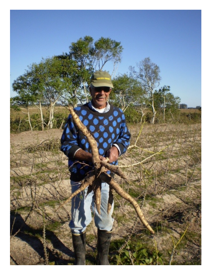
Figure 4. Landrace of cassava cultivated in southern Brazil by descendants of Azorean (Portuguese) farmers.

More than genetic heritage, the landraces of these crops represent a continuous cultural celebration, which includes everything from the names assigned to them by the farmers (like beans "quero-quero", whose bicolour grain—white and black—have a pattern of colours that resembles a bird typical in southern Brazil called "quero-quero") to their use in preparing a wide range of traditional dishes (like the "little soup" beans, whose consumption as soup is recommended for pregnant women), and many other purposes. Regrettably, much of the genetic diversity that has been used all along for such a cultural celebration has been or is being lost due to urban migrations and changes affecting farming systems, more and more geared towards commercial standardized varieties of few commodity crops.