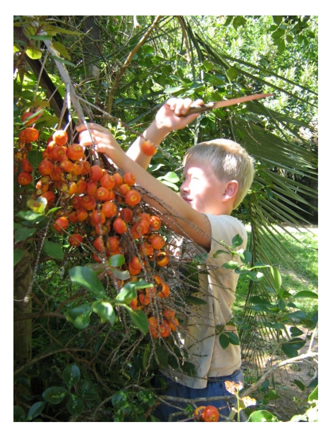
Figure 3. Farmer child descendant from German immigrants in southern Brazil picking a bunch of jelly palm (butiá - Butia odorata ).

researchers in describing jelly palm has recently been developed in collaboration with Bioversity International that it is currently being validated [46].