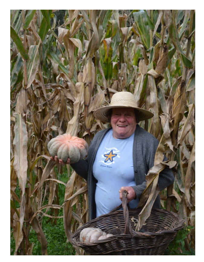
Figure 2. Farmer descendant of Italian immigrants in southern Brazil showing a landrace of pumpkin ( Cucurbita maxima ) cultivated by her family.

In the last three decades, a massive loss of farmers' varieties has occurred, being replaced by just a few high-yielding and hybrid varieties [24]. Other factors driving genetic erosion are rural exodus (particularly of the youth) and urbanization [5].